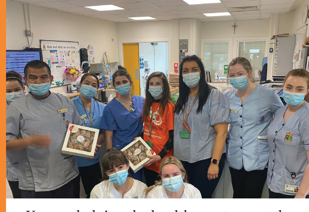
You are helping the healthcare team at the Mater save lives through your ongoing and regular support.