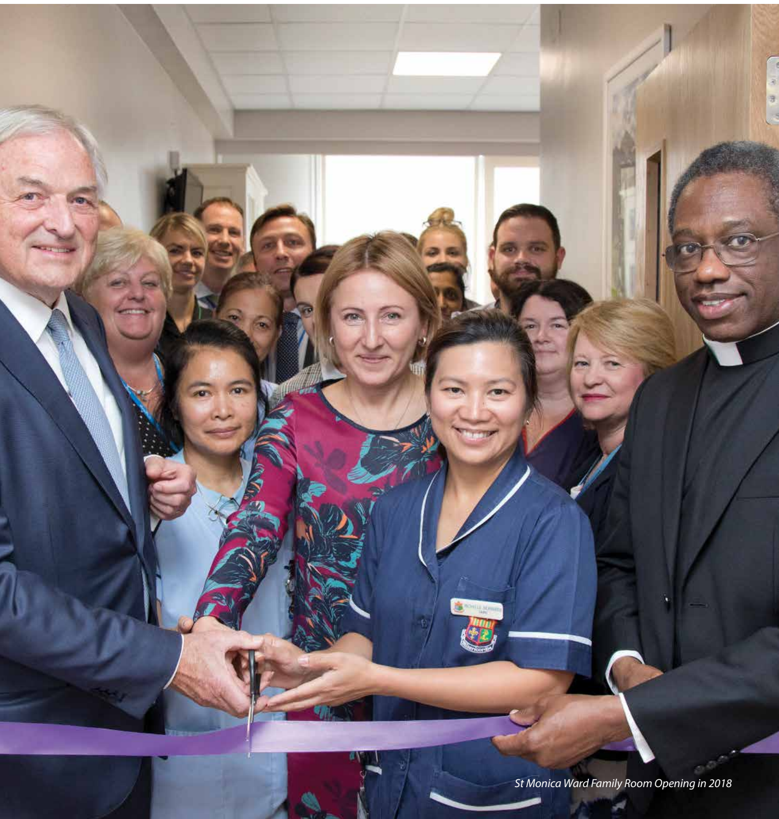
St Monica Ward Family Room Opening in 2018