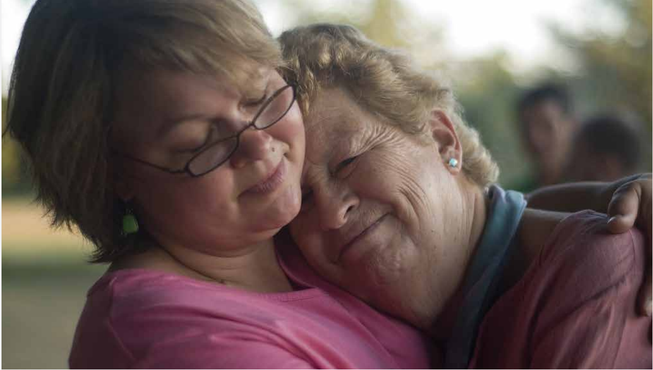
Family Rooms offer dignity and privacy.