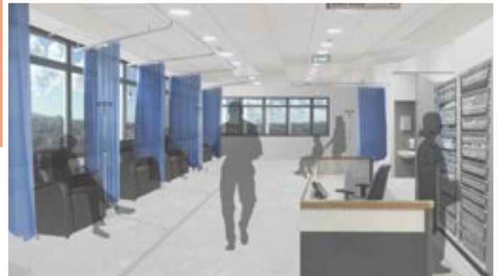
An impression of what the new St Vincent's Day Ward will look like.

Every day up to 40-45 people receive critical, lifesaving treatment in this Day Ward at a very vulnerable time in their lives.