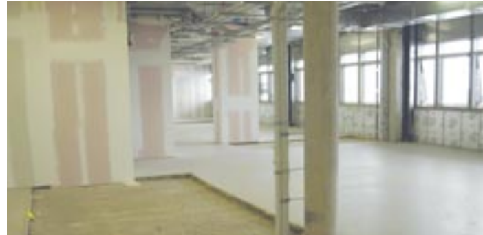
A photo of what the space currently looks like.

The care on the Ward is second to none however the facilities are no longer suitable for the number of patients being treated and a new state of the art facility is urgently needed.