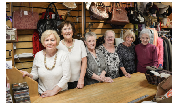
A big, big thank you to all the volunteers who run the Mater Hospital Charity Shop on Dorset Street.