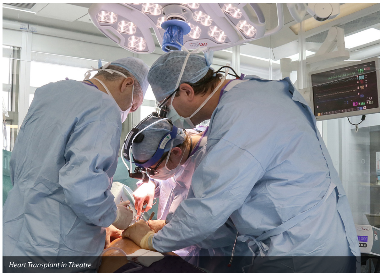
Heart Transplant in Theatre.