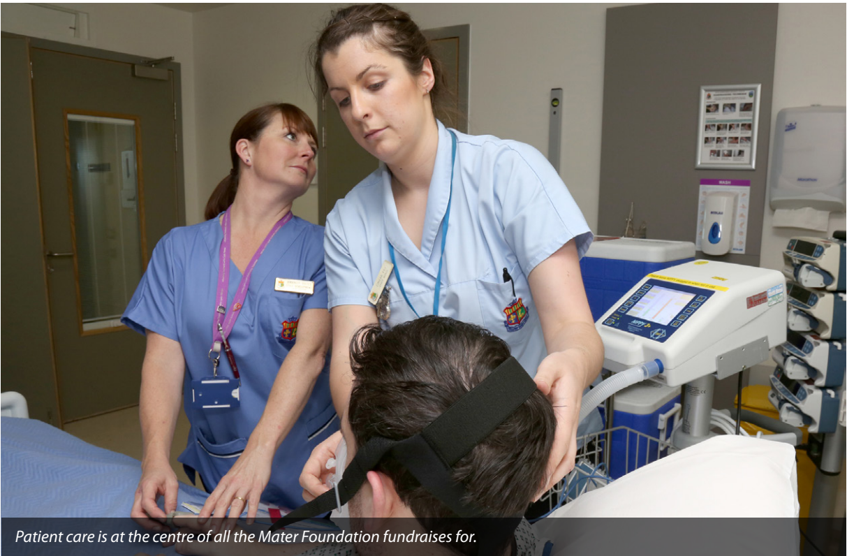
Patient care is at the centre of all the Mater Foundation fundraises for.

In 2015 the Mater Foundation granted over €1.9 million to support and fund specific projects within the Mater Public Hospital in a variety of areas.