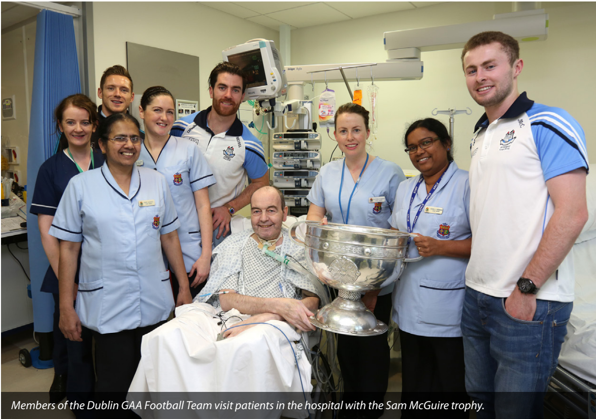
Members of the Dublin GAA Football Team visit patients in the hospital with the Sam McGuire trophy.