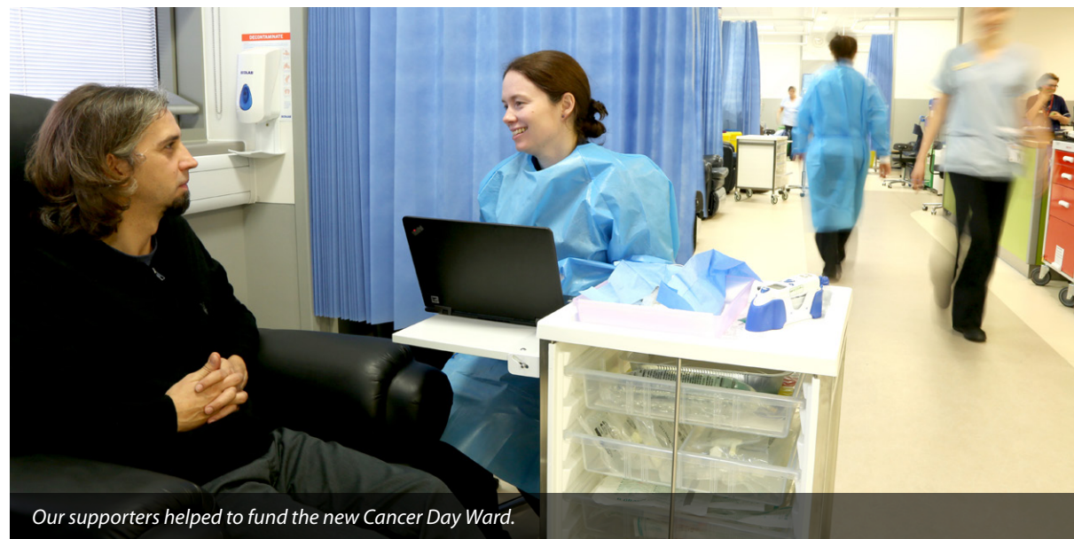
Our supporters helped to fund the new Cancer Day Ward.