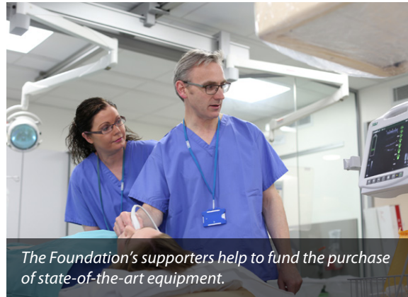
The Foundation's supporters help to fund the purchase of state-of-the-art equipment.