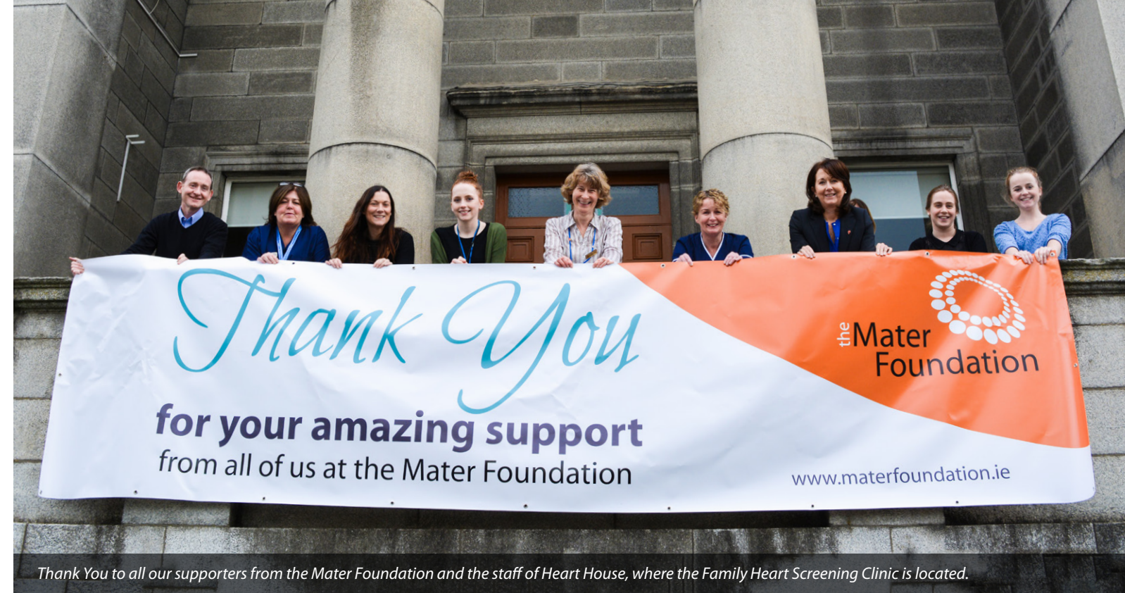
Thank You to all our supporters from the Mater Foundation and the staff of Heart House, where the Family Heart Screening Clinic is located.