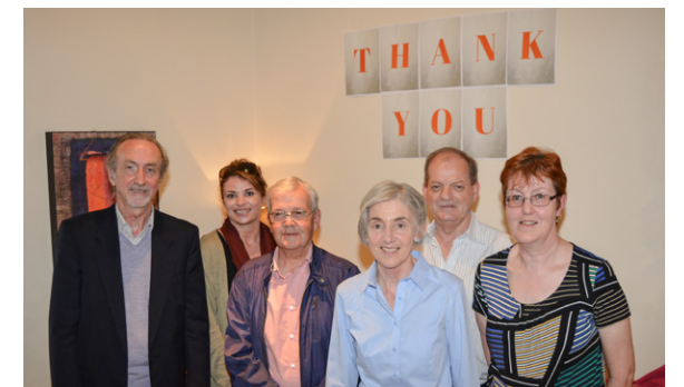
Our wonderful volunteers that run the Mater Foundation's charity stand in the hospital.