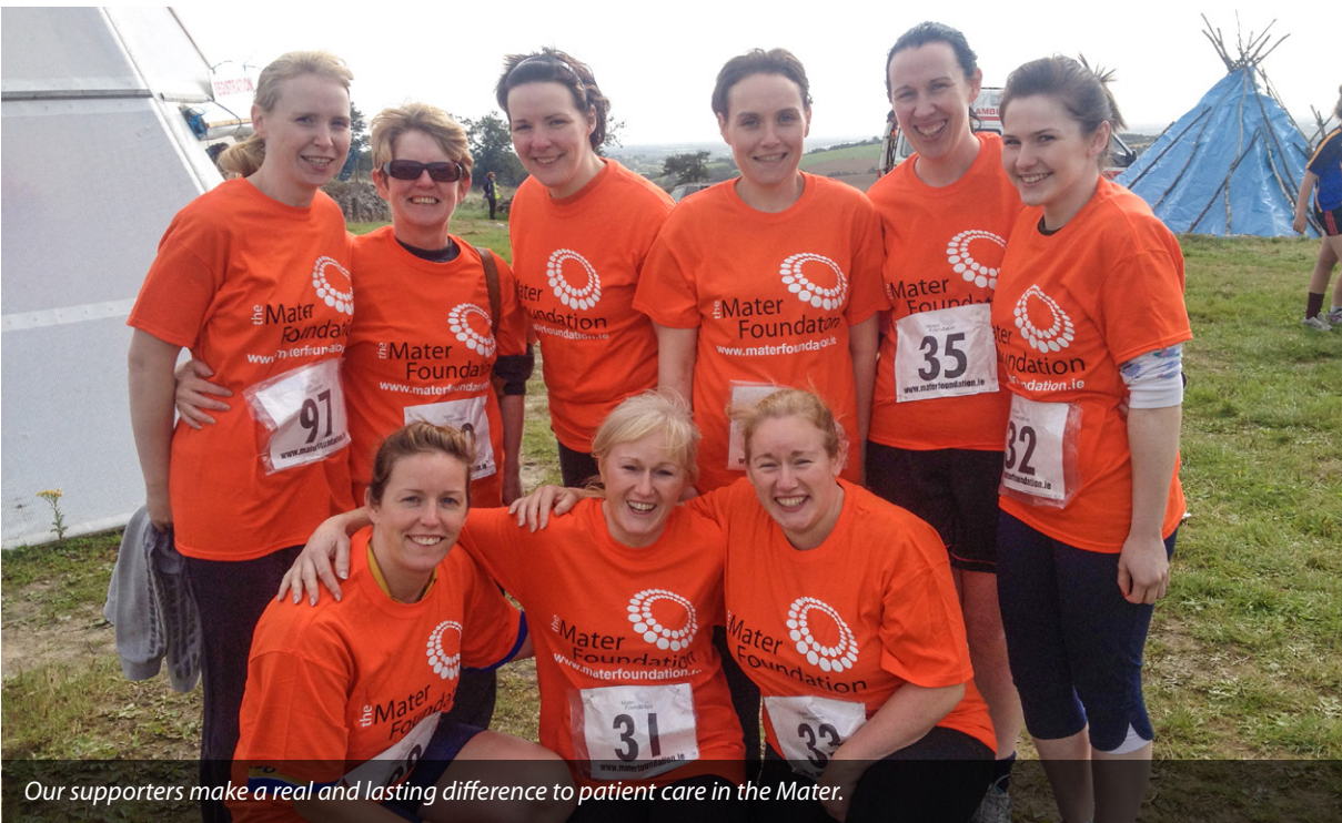
Our supporters make a real and lasting difference to patient care in the Mater.

The Mater Foundation is committed at all times to treating its donors and supporters with the highest level of care and respect. We have developed a Donor Charter to assure all our supporters and potential donors of our commitment to honesty, openness and transparency. We are enthusiastic signatories of the Statement of Guiding Principles for Fundraising, and abide by their guidelines at all times. For the full Donor Charter, please go to www.materfoundation.ie We promise you that your donation will be used for the purpose intended, and that all general donations or any surplus in specific appeals will be used for best advancing our priorities of patient care in the hospital. We strive to keep administrative and fundraising costs to a minimum, and are open about who is sitting on the Foundation’s governing board, and that the board will exercise prudent judgment in its stewardship responsibilities. Recently published financial accounts are available to everyone, as are all agreed procedures for making and responding to complaints.